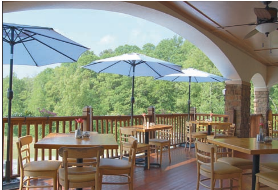
Gracious dining near Dahlonega's historic town square

Just outside picturesque Dahlonega, there is a casual and friendly restaurant where the ambiance is as imaginative as the food, and the prices belie the quality: Yahoola Creek Grill.